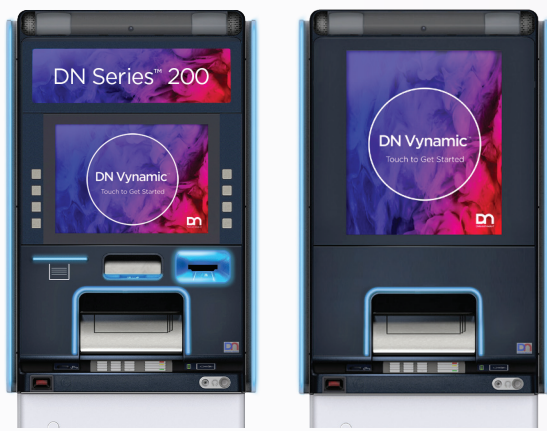
Physical → Digital