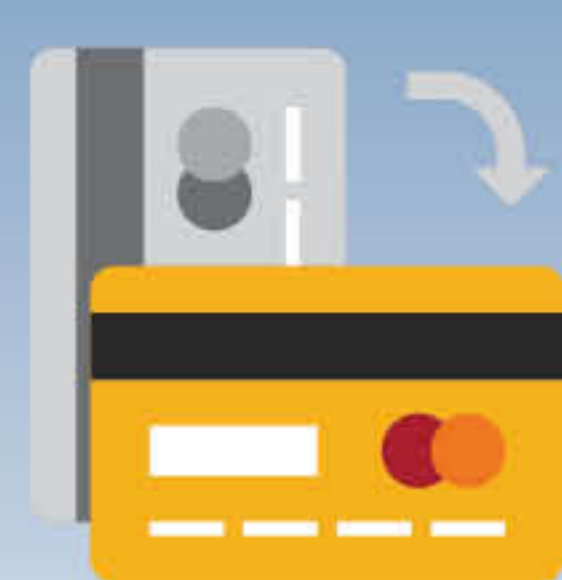
1. Rotate Card 90°