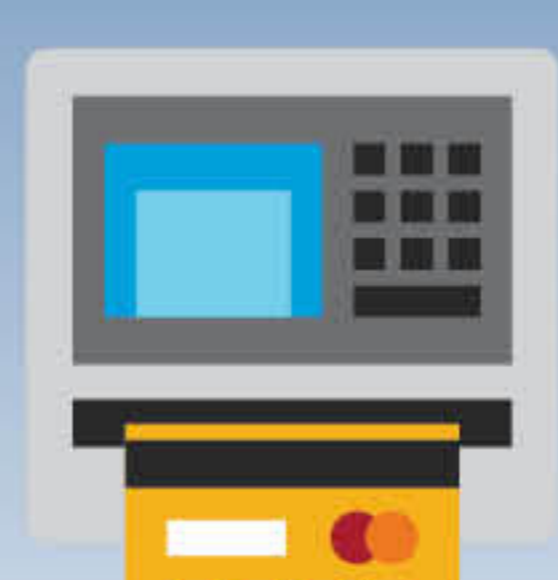
2. Insert Card Long-Edge First